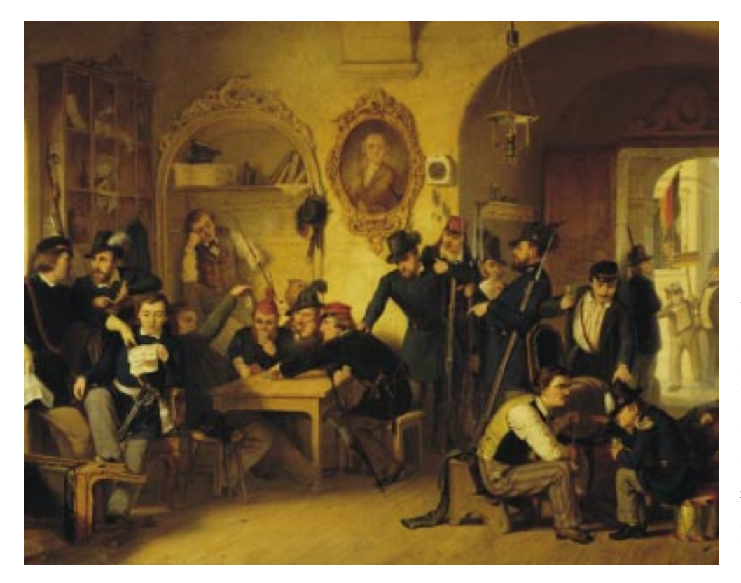
AUSTRIAN STUDENTS IN THE REVOLUTIONARY CIVIL GUARD. In 1848, revolutionary fervor swept through Europe and toppled governments in France, central Europe, and Italy. In the Austrian Empire, students joined the revolutionary civil guard in taking control of Vienna and forcing the Austrian emperor to call a constituent assembly to draft a liberal constitution.

worked vigorously to restore the imperial government in Hungary. The Austrian armies, however, were unable to defeat Kossuth's forces, and it was only through the intervention of Nicholas I, who sent a Russian army of 140,000 men to aid the Austrians, that the Hungarian revolution was finally crushed in 1849. The revolutions in Austria had also failed. Autocratic government was restored; emperor and propertied classes remained in control while the numerous nationalities were still subject to the Austrian government.