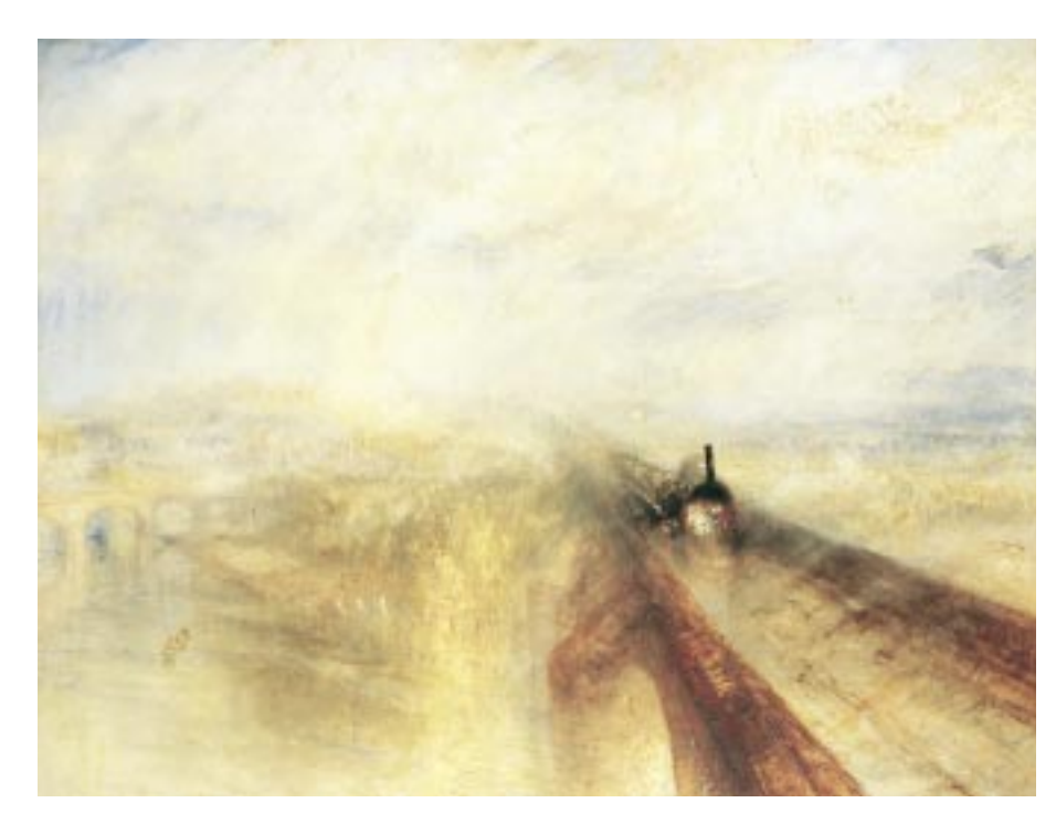
J. M. W. TURNER, RAIN, STEAM, AND SPEED—THE GREAT WESTERN RAILWAY. Although Turner began his artistic career by painting accurate representations of the natural world, he increasingly sought to depict an atmosphere by a skillful use of light and color. In this painting, Turner eliminates specific details and uses general fields of color to portray the image of a locomotive rushing toward the spectator.

To many Romantics, music was the most Romantic of the arts because it enabled the composer to probe deeply into human emotions. One Romantic writer noted: "It has been rightly said that the object of music is the awakening of emotion. No other art can so sublimely arouse human sentiments in the innermost heart of