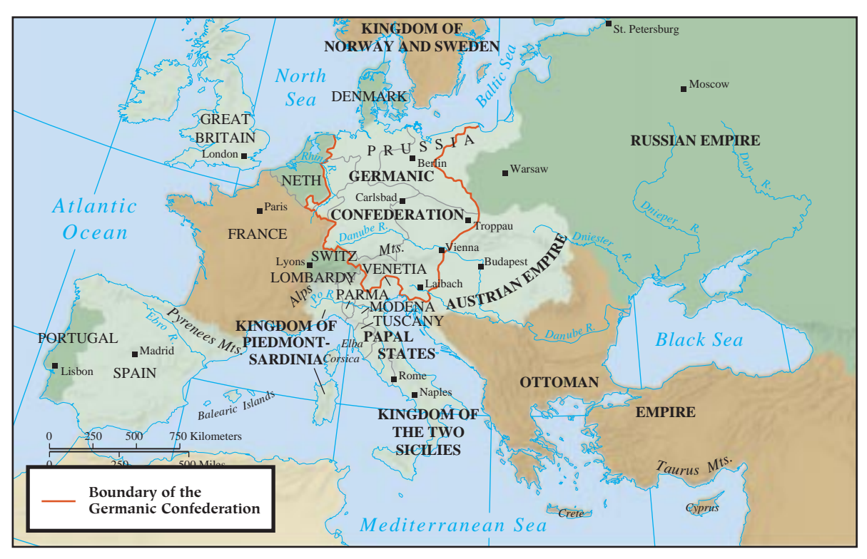
MAP 21.1 Europe after the Congress of Vienna.

Elsewhere, however, the principle of legitimacy was largely ignored and completely overshadowed by more practical considerations of power. The congress's treatment of Poland, to which Russia, Austria, and Prussia all had claims, illustrates this approach. Prussia and Austria were allowed to keep some Polish territory. A new, nominally independent Polish kingdom, about three-quarters of the size of the duchy of Warsaw, was established with the Romanov dynasty of Russia as its hereditary monarchs. Although the Russian tsar Alexander I (1801–1825) voluntarily granted the new kingdom a constitution guaranteeing its independence, Poland's foreign policy (and Poland) remained under Russian control. Prussia was compensated for its loss of Polish lands by receiving twofifths of Saxony, the Napoleonic German kingdom of Westphalia, and the left bank of the Rhine. Austria in turn was compensated for its loss of the Austrian Netherlands by being given control of two northern Italian provinces, Lombardy and Venetia.