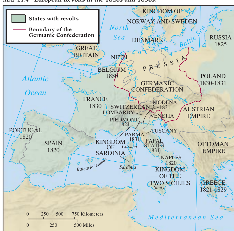
MAP 21.4 European Revolts in the 1820s and 1830s.

The Reform Act gave explicit recognition to the changes wrought in British life by the Industrial Revolution. It disfranchised fifty-six rotten boroughs and enfranchised forty-two new towns and cities and reapportioned others. This gave the new industrial urban communities some voice in government. A property qualification (of £10 annual rent) for voting was retained, however, so the number of voters only increased from 478,000 to 814,000, a figure that still meant that only one in every thirty people was represented in Parliament. Thus, the Reform Act of 1832 primarily benefited the upper middle class; the lower middle class, artisans, and industrial workers still had no vote. Moreover, the change did not significantly alter the composition of the House of Commons. One political leader noted that the Commons chosen in the first election after the Reform Act seemed "to be very much like