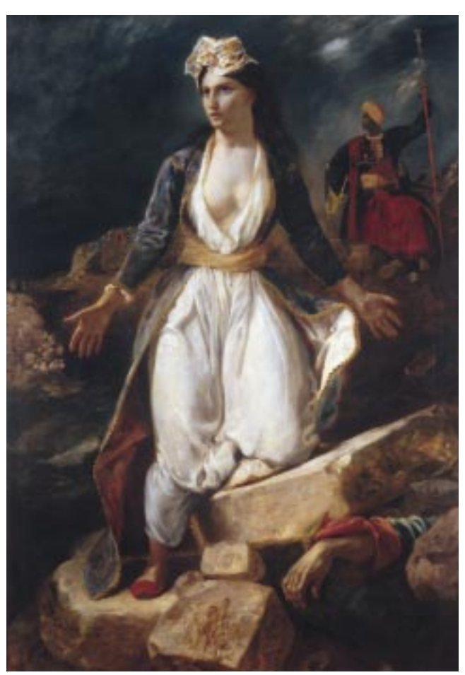
THE GREEK STRUGGLE FOR FREEDOM: EUGÈNE DELACROIX, GREECE EXPIRING ON THE RUINS OF MISSOLONGHI. The Greek revolt against the Ottoman Empire brought a massive outpouring of European sentiment for the Greeks. Romantic artists and poets were especially eager to publicize the struggle of the Greeks for independence. In this painting, the French painter Delacroix personified Greece as a majestic, defenseless woman appealing for aid against the victorious Ottoman Turk seen in the background. Delacroix's painting was done soon after the fall of the Greek fortress of Missolonghi to the Ottomans.

In 1815, Great Britain was governed by the aristocratic landowning classes that dominated both houses of Parliament. Suffrage for elections to the House of Commons, controlled by the landed gentry, was restricted and un-